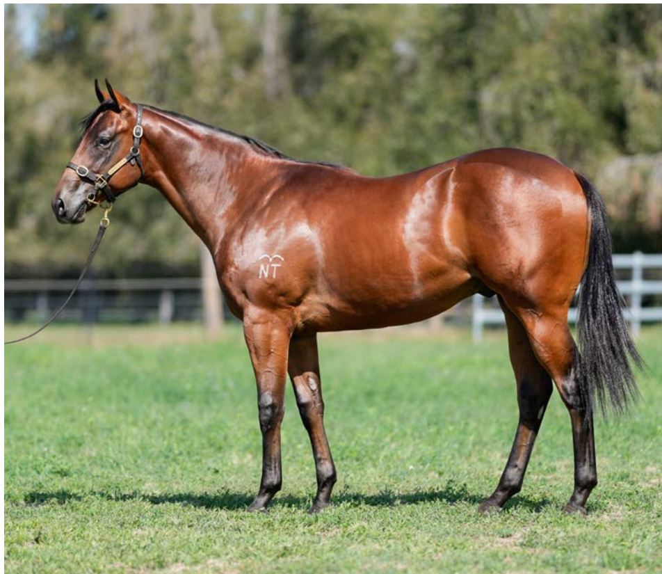
Lot 129: Written By ex Mandalong Snitjess colt

As always, there are theories or reasons as to why the buyers of Mandalong Snitjess and Luminous Eyes, through good fortune or planning, could pick them up so cheaply timely