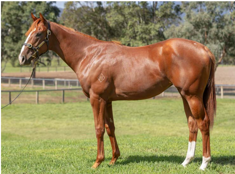
Lot 119: Justify ex Luminous Eyes filly

"The positive inspections were just phenomenal. She had great X-rays, great scope. I'm not sure she'll be a two-year-old, but I reckon she'll be a magnificent three-year-old."